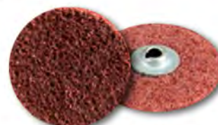
TYPE R & S 1-1/2" - 4" DIAMETER