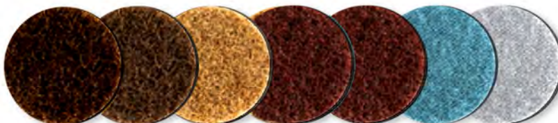
Extra Course HD Brown Extra Course Brown Course Tan Medium Maroon HD Medium Maroon Very Fine Blue Ultra Fine Grey