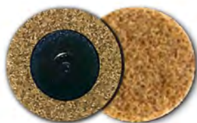
TYPE R PLASTIC ROLL-ON LOCKING STYLE