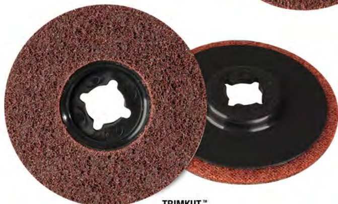
TRIMKUT™ 4 1/2" x 7/8" DEPRESSED CENTER