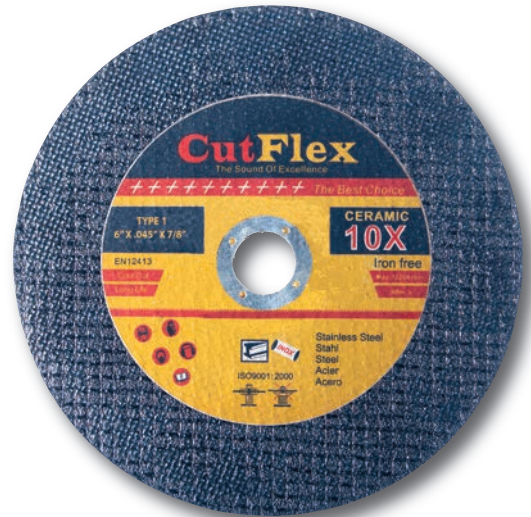
Type 1-Type 27 Thin Cutoff Wheels