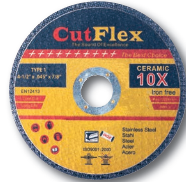
Type 1-Type 27 Thin Cutoff Wheels