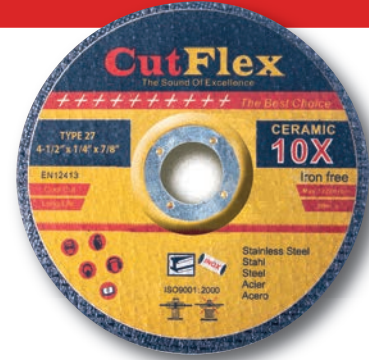
Type 27 Cutting & Grinding Wheels