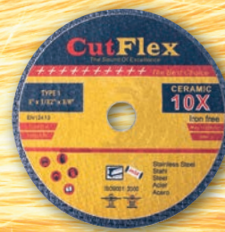
Type 1 Small Diameter Cutoff Wheels